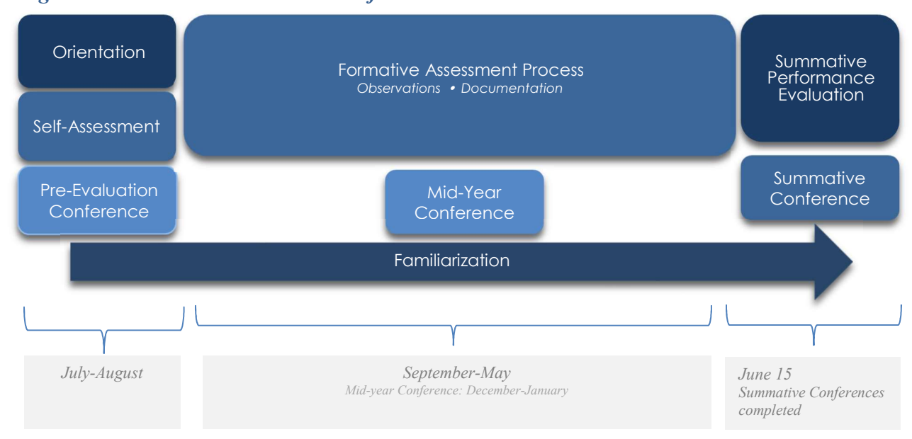
Figure 4: Teacher Assessment on Performance Standards Process Flow

The process by which LEAs shall implement the TAPS portion of the Teacher Keys Effectiveness System is depicted in Figure 4. This flow chart provides broad guidance for the TAPS process, but LEAs should consider developing internal timelines for completion of steps at the LEA and school level.