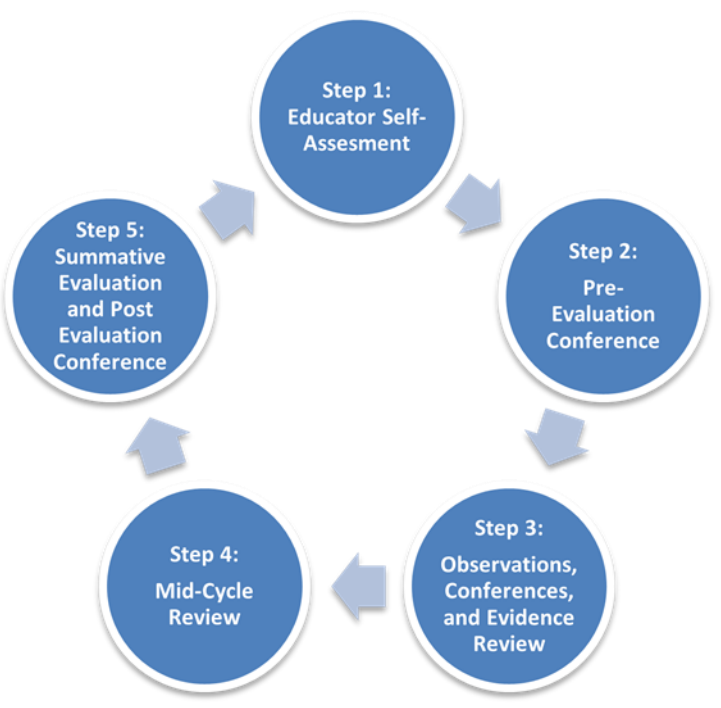
Figure 1: Evaluation Cycle

At the beginning of the school year, the educator receives a complete set of materials that includes the Teacher-Librarian Instructional Practice Standards and the Teacher-Librarian Professional <u>Responsibilities Standards</u> rubrics with Standards, Indicators, Performance Level, and evidence sources, as well as access to the current year <u>NEPF Protocols</u> outlining the evaluation process. The educator and evaluator meet to establish expectations and consider goals. They discuss the evaluation process together (including observations/visits, review of evidence, etc.) and review the NEPF Rubrics that describe the Standards and Indicators. The purpose of this review is to develop and deepen shared understanding of the Standards and Indicators in practice. The rubric review is also an opportunity to identify specific areas of focus for the upcoming school year.