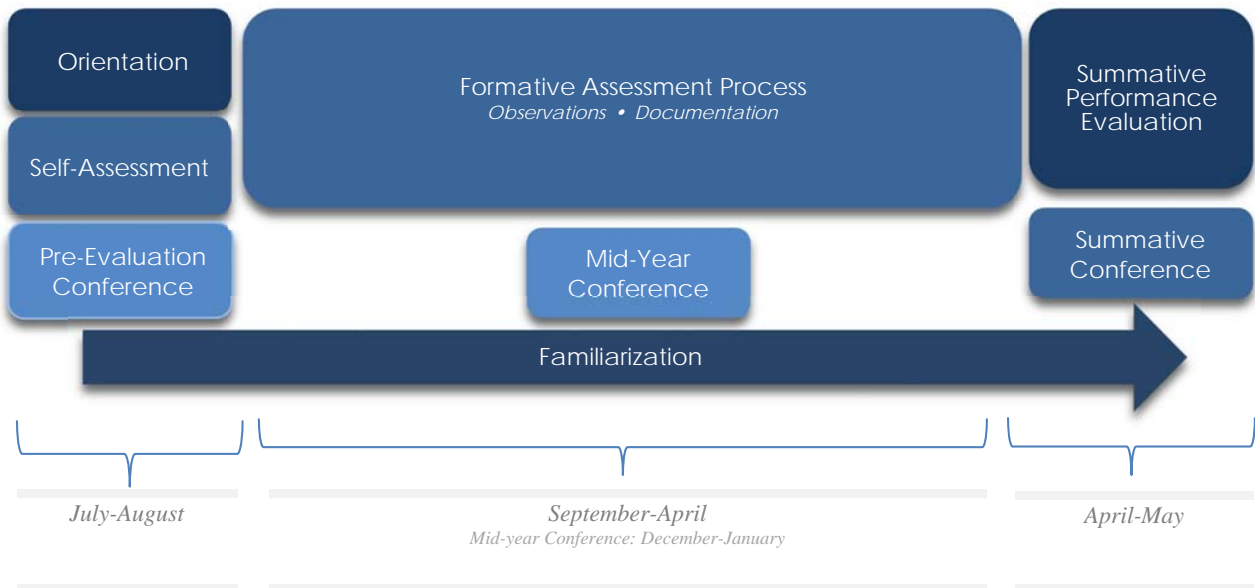
Figure 4: Teacher Assessment on Performance Standards Process Flow

The process by which LEAs shall implement the TAPS portion of the Teacher Keys Effectiveness System is depicted in Figure 4. This flow chart provides broad guidance for the TAPS process, but LEAs should consider developing internal timelines for completion of steps at the LEA and school level.