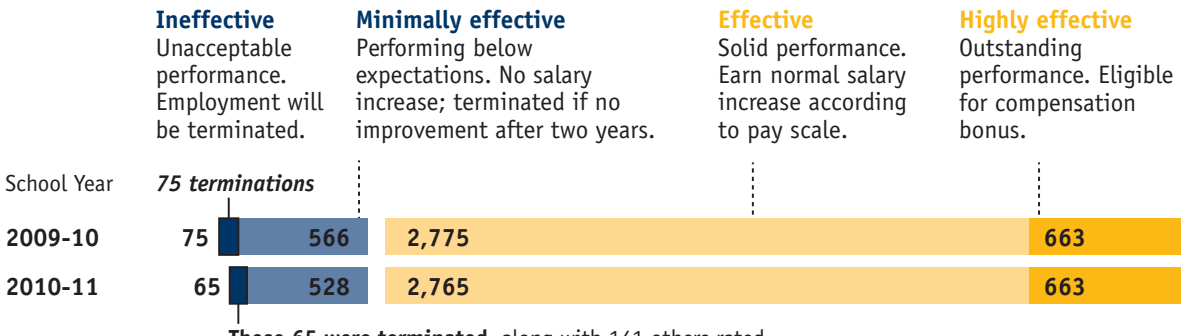
FIGURE 13: Results from DC's IMPACT SYSTEM

Take the second-year data from D.C. 's IMPACT system. It resulted in the top 663 teachers (16 percent of the workforce) being eligible for bonuses of up to $25,000. That approximates pretty closely to what economists estimate is the percentage of truly exemplary teachers on the average district payroll.